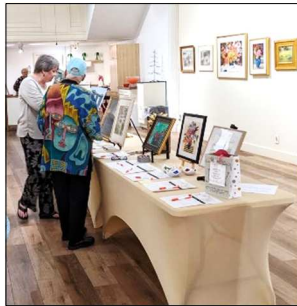
Shopping at the silent auction.