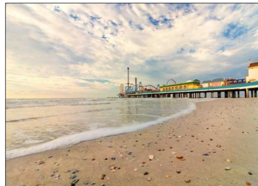
Pleasure Pier Beach

The March Featured Artist is to be announced.