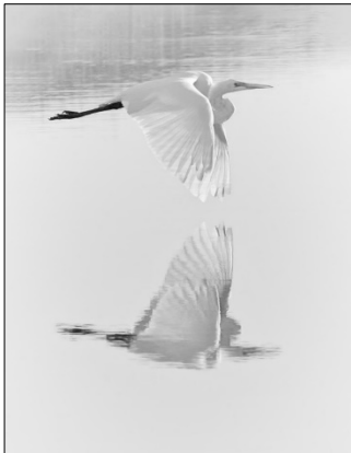
Grace in Flight