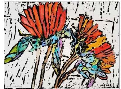
Florist's Sunflower #4