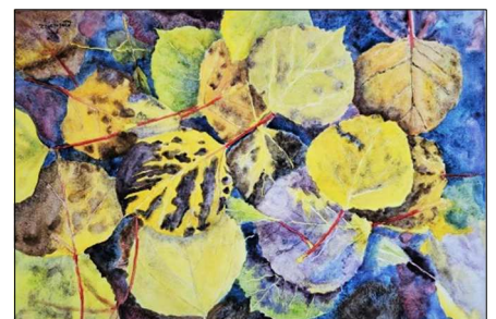
Aspen Leaf Fall