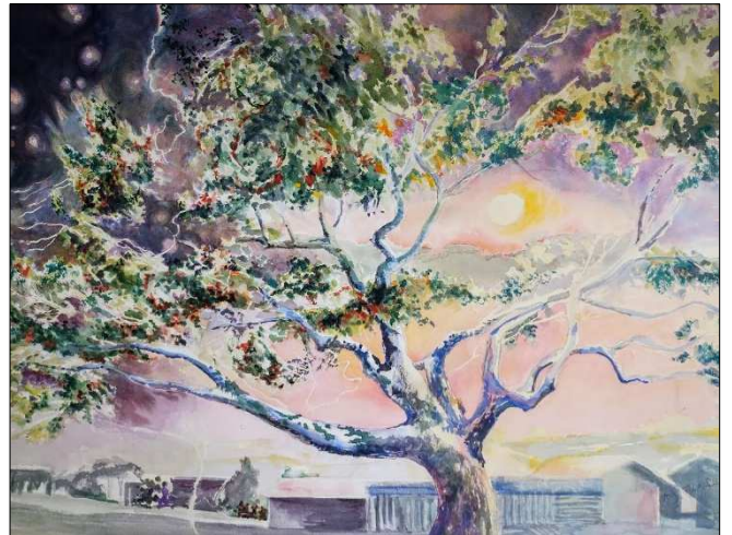
Good Morning Tree